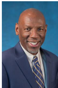
Geoffrey Canada President Harlem Children's Zone

Click here to watch the Special Keynote Address