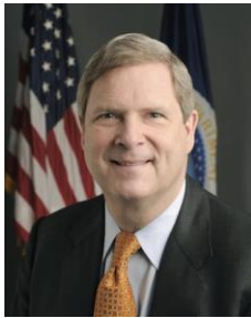
Opening Remarks: Thomas J. Vilsack Secretary of Agriculture U.S. Department of Agriculture